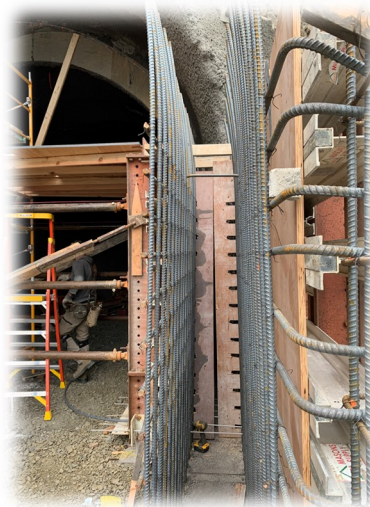
Right: East bench picket base concrete pouring