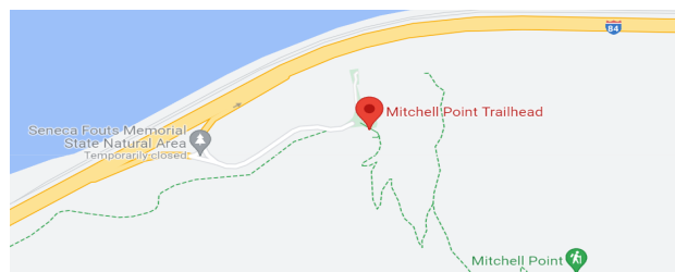
The lookout exit at Mitchell Point is closed until further notice.