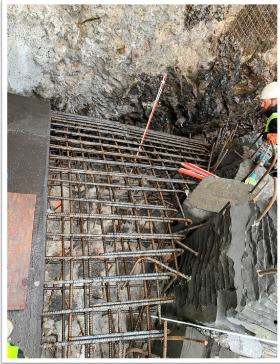
Concrete Forming in West Portal Arch