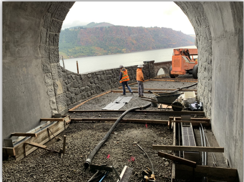
Basalt Band and Trench Drain Concrete Pour