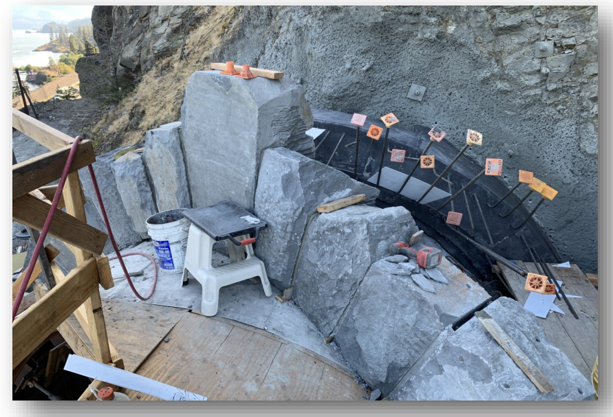
Arch Stone Installation in West Portal