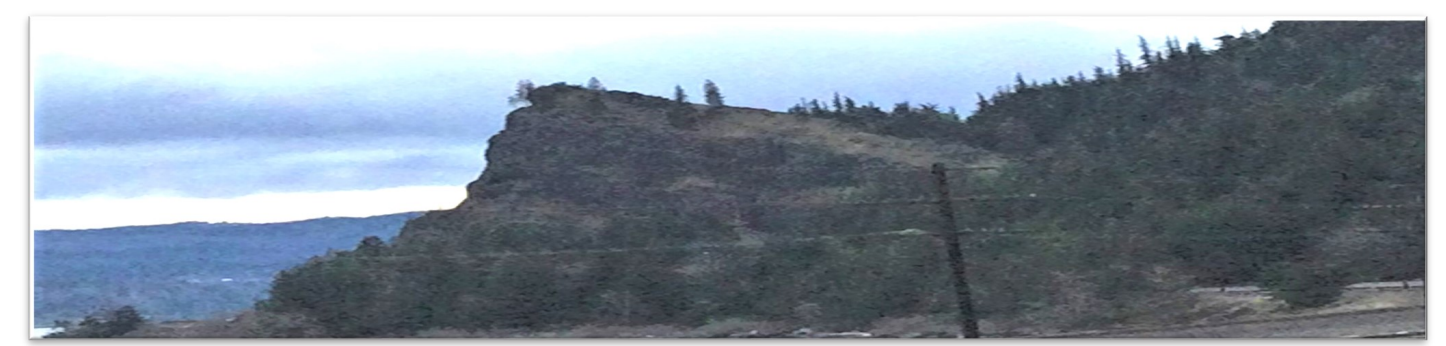
September 22, 2023