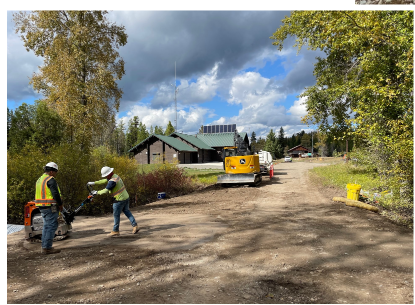
Culvert Installation on North Fork Road