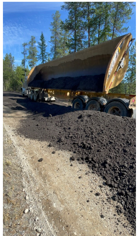
Placing Recycled Aggregate Base on N. Belton Stage Road.