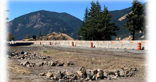
(All images) Source: FHWA

The Contractors' work hours are: Monday - Friday from 7:00am - 5:30pm.