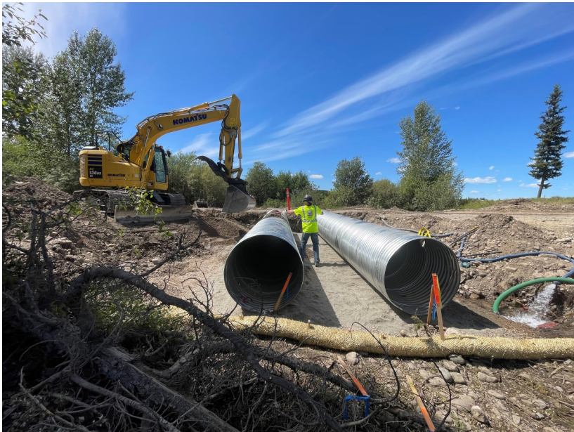
42" Culvert Installation at Glacier Drive