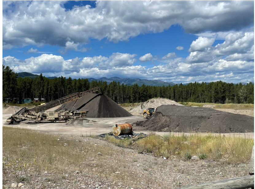
Processing Milled Asphalt at Gladys Glen