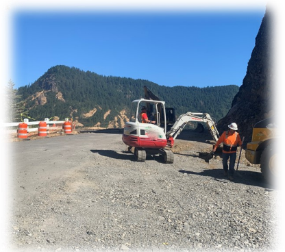
Below left & right: Backfill and compaction on East bench