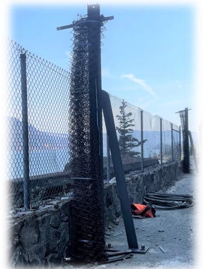
Right: Posts on West bench