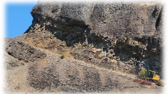
Bottom Right: Excavator clearing trail for drilling machines