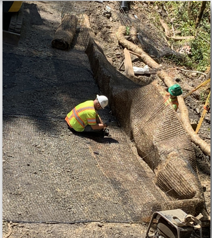
Installing Support Strut in MSE Wall