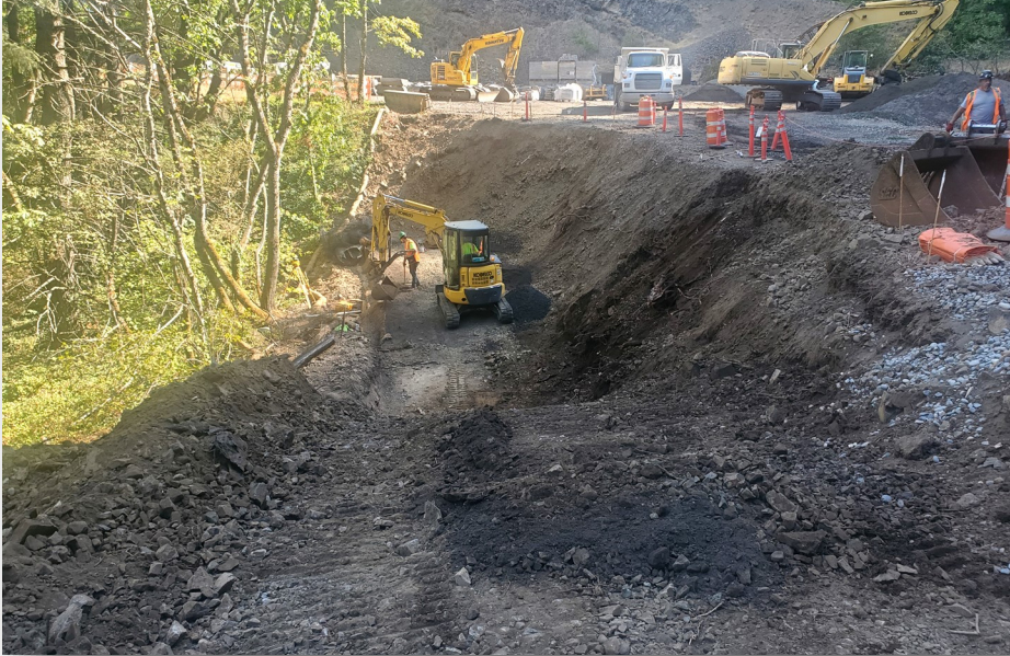
MSE Wall Work At West Trail