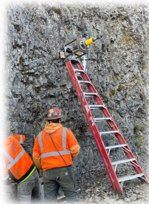
Left: Testing anchor pull strength