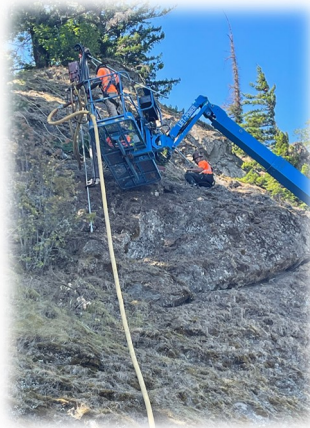
Left: Anchor drilling on East bench