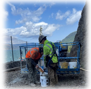
Right: Mixing grout