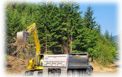
Right: Clearing Below: Fabric as one rockfall protection method