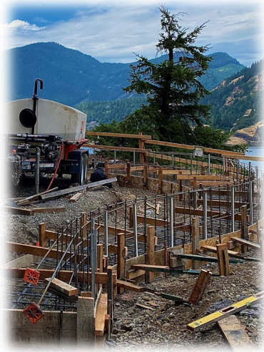
Left & Right: East Bench structure concrete form and rebar at outlook