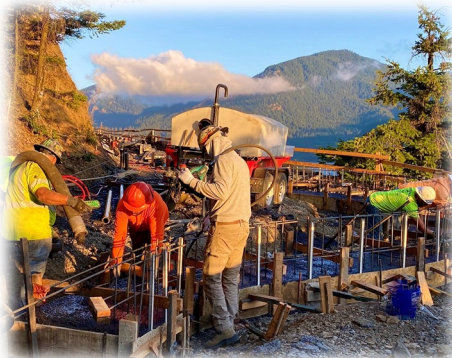
Left & Below: Concrete pour