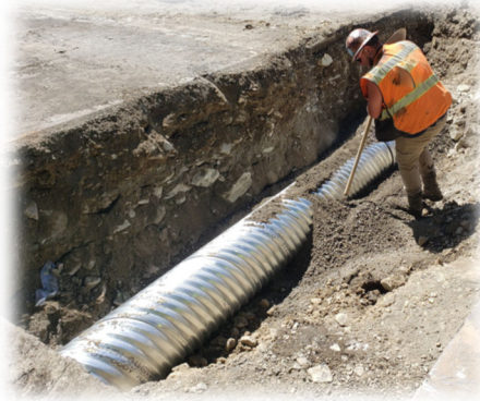
Compaction of backfill