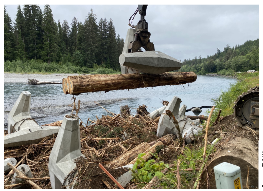
ICI constructing Engineered Log Jam #16 at MP 4