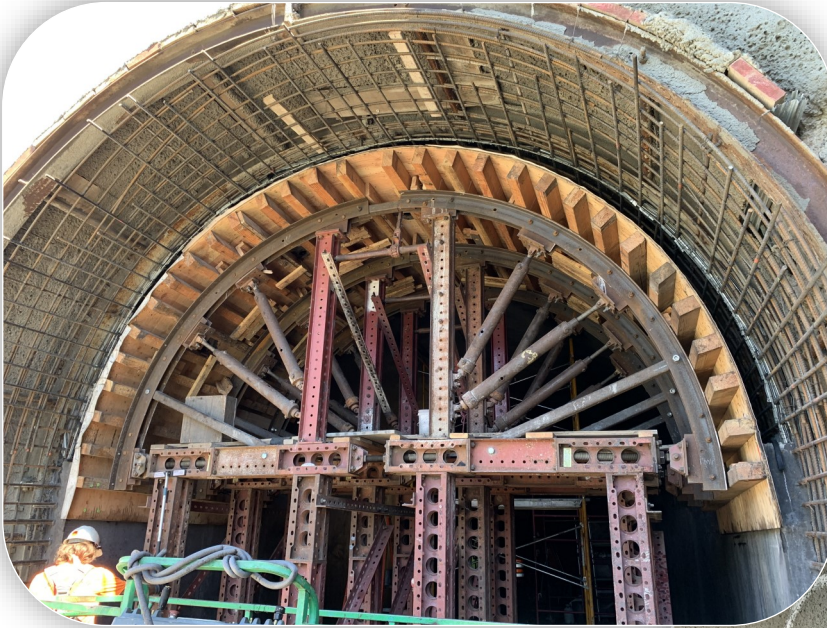
Concrete Form Work at West Portal Arch