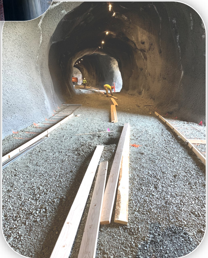
Reinforced Concrete Pavement Forming in Tunnel