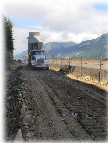
Left & Right: Laying down rock debris