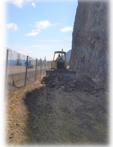
Below Left & Right: West side bench clearing