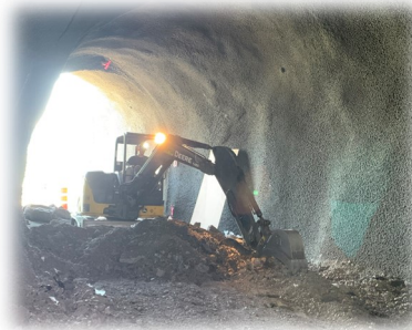
Left: Tunnel grading