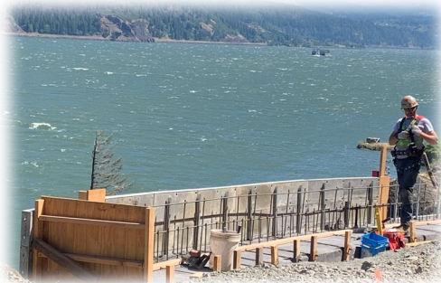
East bench wall forming