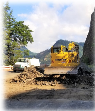
Left, Right & Left Below: Bench clearing and rock removal