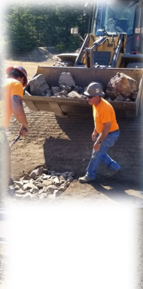
Left & Below: Dry swale—filling the holes with rock