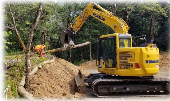
Left: Placing felled trees on cut banks at emergency vehicle turnaround on the East side of the project.