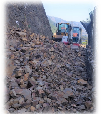
Right: West bench clearing