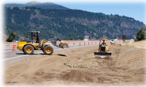
Right and Below: Dry swale cut and fill