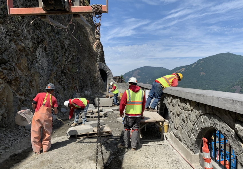
Stone Veneer Work at East Bench Retaining Wall

Project Website: https://highways.dot.gov/federal-lands/projects/or/dot-crgnsa-100-4