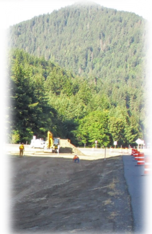
(All Project images) Source: FHWA