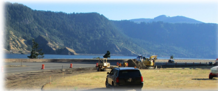
Excavation and construction of dry swale on the West side of Mitchell Point.