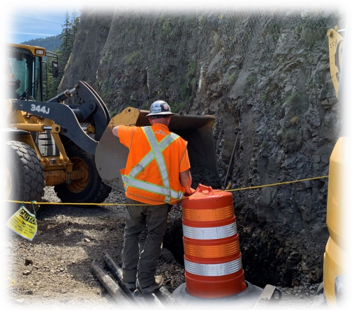
Adit #3 shotcrete curing curtain installation