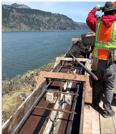
Below: Concrete Pouring at West Bench Top of Railing