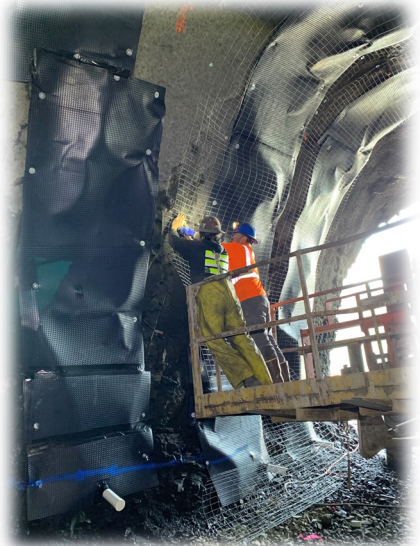
Left: Wire Mesh placed over drain mats