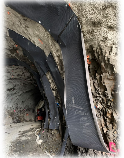
Right: East portal geocomposite drain mat installation