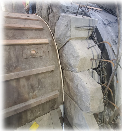
Below Left & Right: Stone arch placement