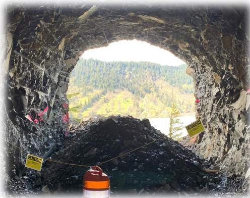
Below and Right: Adit #1 & #2 mechanical excavation