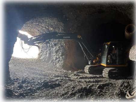
Below: Adit #1 excavation