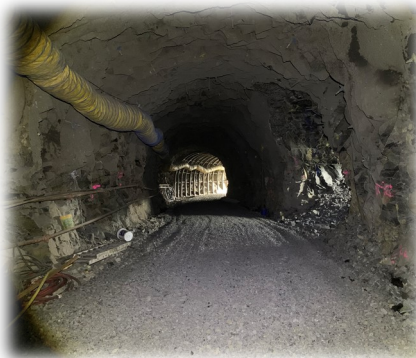
Top: West tunnel Adit #1 & East tunnel Adit #3