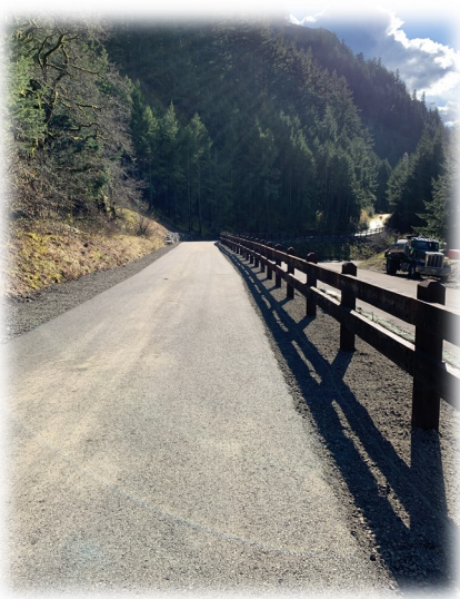
Left: Finished trail at Big Cut and Little Cut