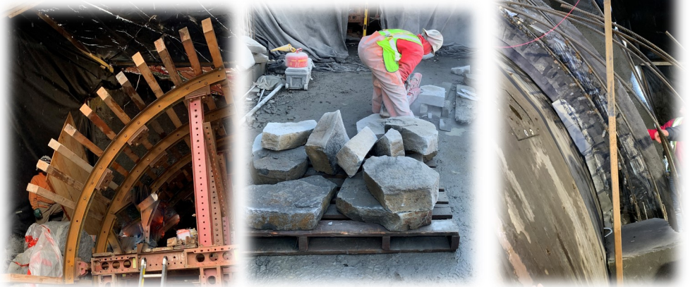
Below Left & Right: West portal concrete forming and pouring