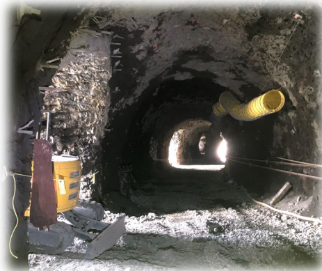
Top: Adits 4 & 5, East Portal