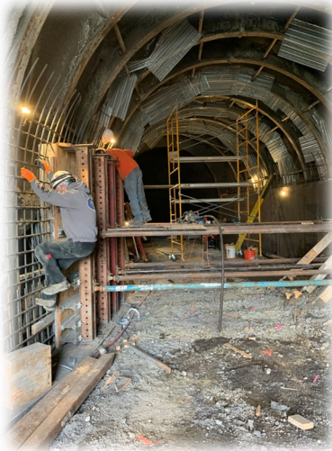
Left: West tunnel portal wall structure concrete pouring