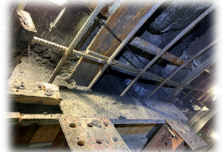
Right: West portal structure concrete wall support