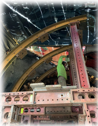
Left & Right: East portal tunnel arch concrete form support assembly