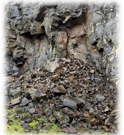
Adit #5 mechanical excavation