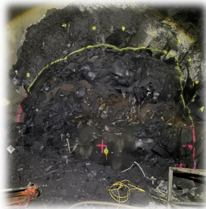
Adit #5 rock bolts

Below & Right: Adit #1 spiles installation markings & tunnel spiles bolting