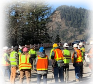
DOT and guest tour on site safety briefing