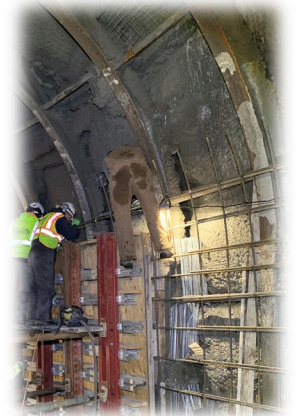
(All images) Source: FHWA