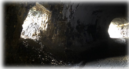
Below & Right: Adit #5 inside outside view