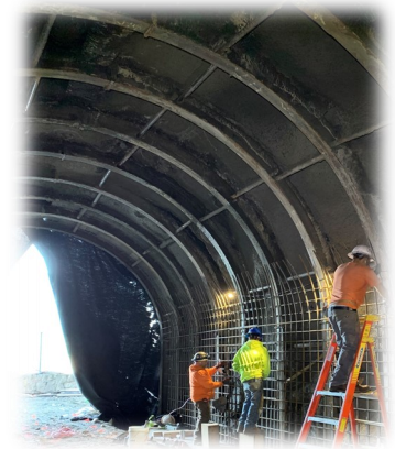
Below Left: West portal type 3 area rebar installed on South side

Left and Right: West portal reinforce concrete form up to spring-line