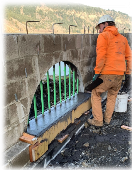
Left and Right: Picket infill concrete at West bench