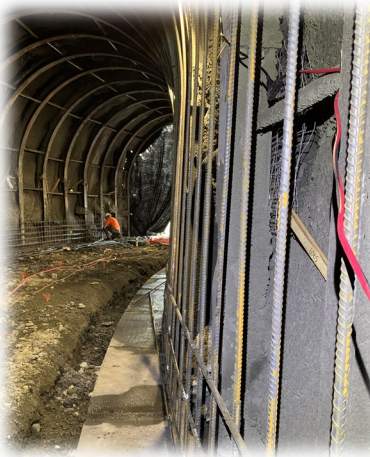
Left: Reinforcing steel installation at West portal