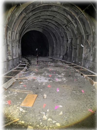
Left and Below: West portal structure concrete footing work