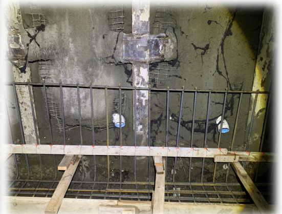
Right, Below Left and Right: Work on arch portion of East Portal structure