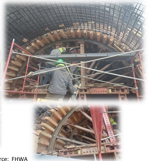
(All images) Source: FHWA