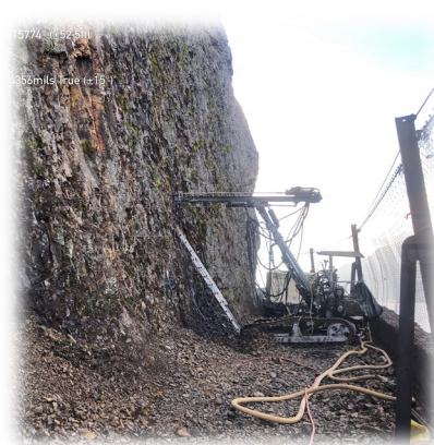
Below & right: Line drilling adit, installing temporary utilities in West tunnel