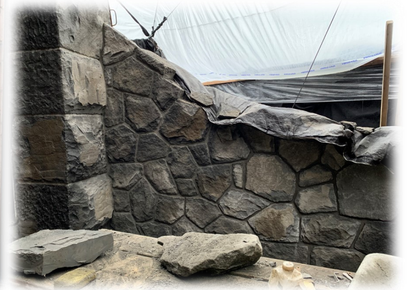
Below: East portal North wing wall veneer stone work