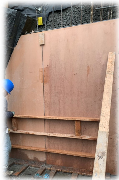
Left: East portal arch concrete forming