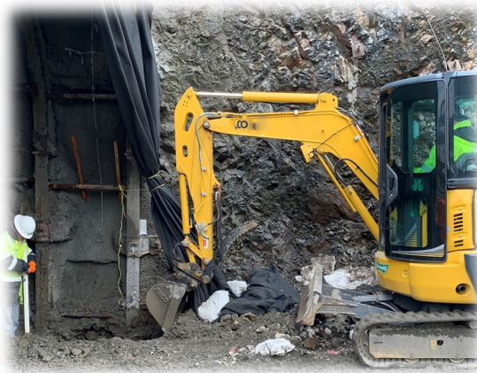
Left: West portal foundation excavation