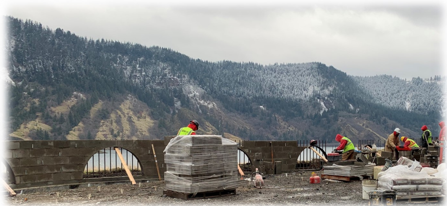
Below: Concrete Masonry Unit walls at West Bench (2 pics), and structural concrete form work at East portal