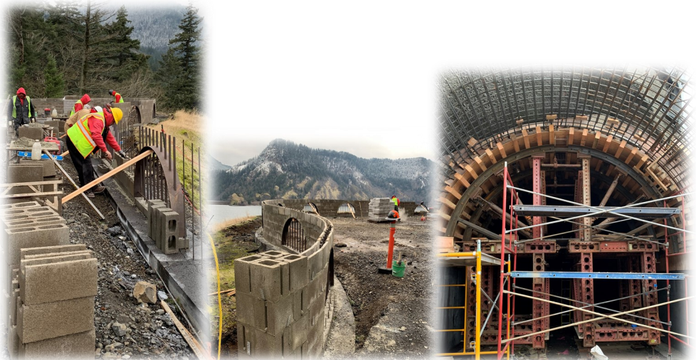
(All images) Source: FHWA