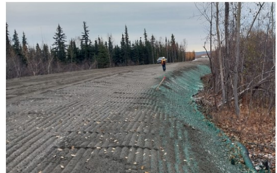
Top right: Sampling aggregate for lab testing.